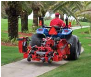
Outer two decks fold hydraulically to 78" (2 M) for transport